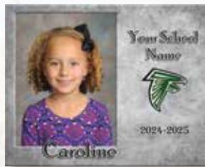
School Spirit Portrait