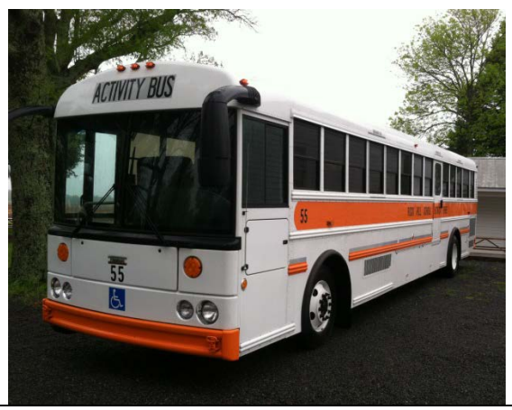
Replace Activity Buses and Service Vehicles