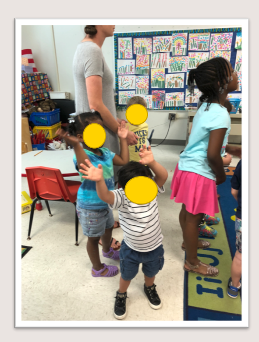
Children dancing to a song the body and health