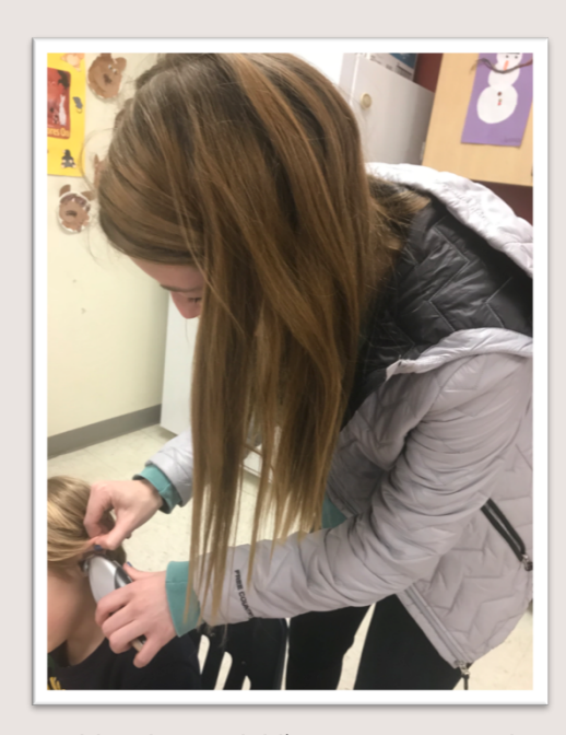
Me taking a child's temperature with a tympanic thermometer